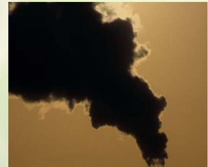
Averting more than 4.9 million lbs of CO 2