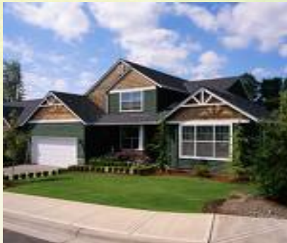
Powering 275 AZ Homes