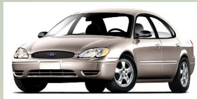
Taking 420 Cars Off the Road