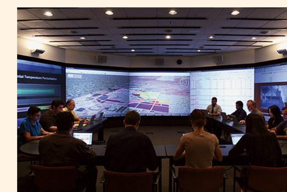
Photo of Decision Theater at Decision Center for a Desert City, Arizona State University

• Groups immerse themselves in the consequences of the needs, values, and formal and informal rules that determine their actions