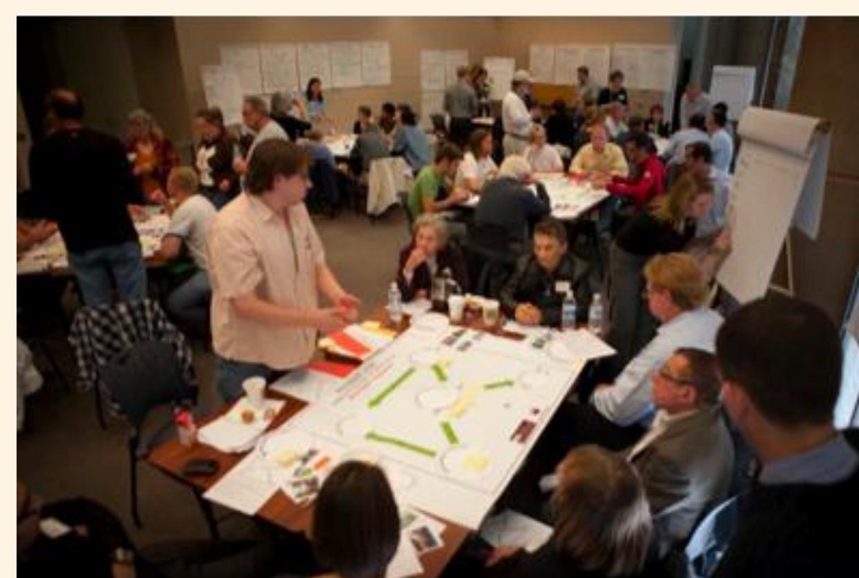
March 6th, 2010 Visioning Workshop with the City of Phoenix Planning Department and Citizen Stakeholders