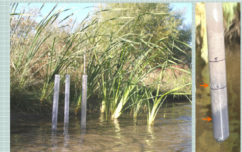
Figure 3. Standpipes used to measure the rate of infiltration of water through the sediments. A close inspection of one of the pipes reveals visible signs of microbial activity – gas bubbles and a black zone of FeS precipitates.