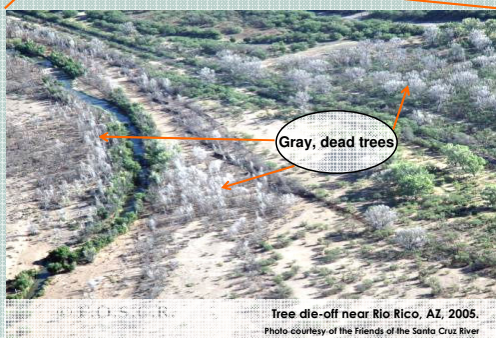
Figure 1. The Santa Cruz River is an effluent-dominated river that receives water from treatment plants that discharge tertiary treated effluent into the river bed at Nogales and Tucson. The San Pedro, a non effluent-dominated river to the east, serves as a control site. An aerial view shows a recent tree die-off near the river.