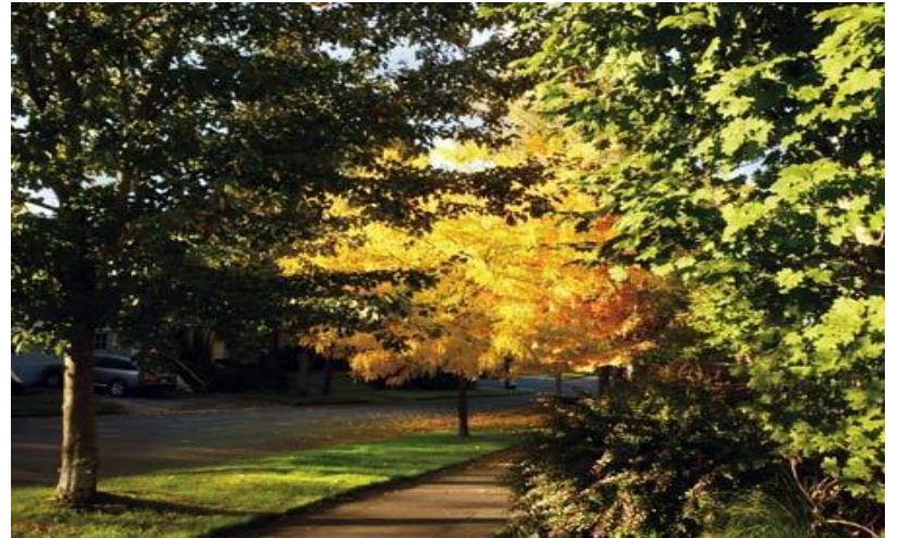
(Portland Street Trees)