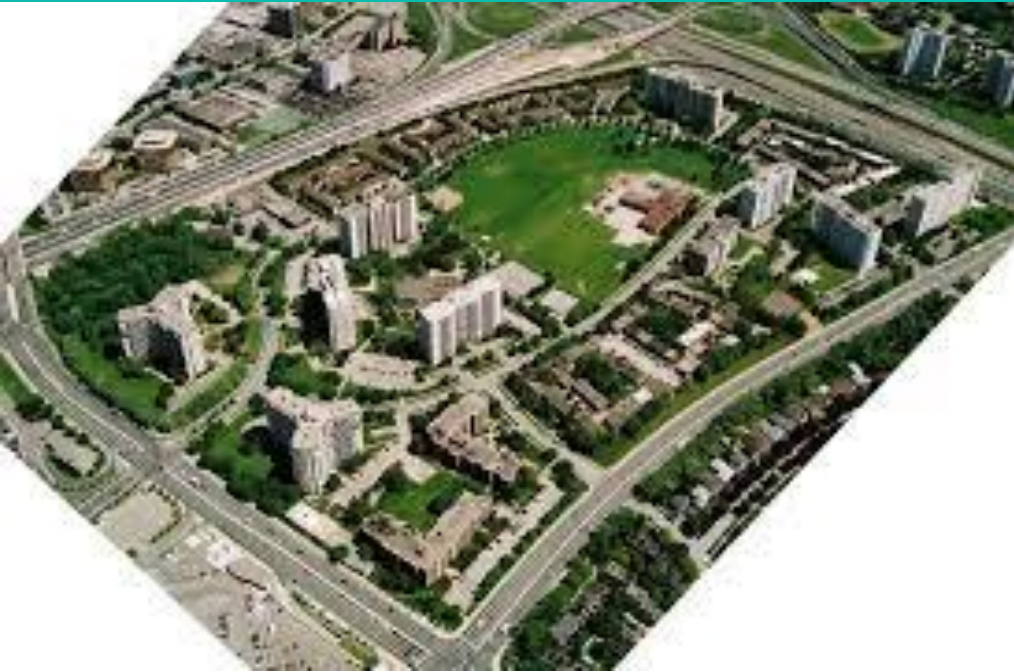
(Parkway Forest in Toronto)